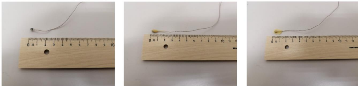
Figure 1: Sensor types (from left to right: out of the box, latexed, latex flap)

Our findings from the literature review and the experiment highlight the need for thoughtful sensor placement and data collection practices.